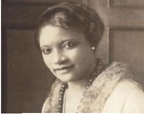
Madame C.J. Walker